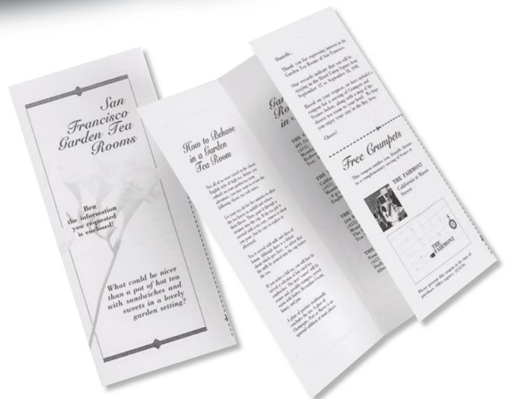
▶ C- or Z-FOLD MAILERS