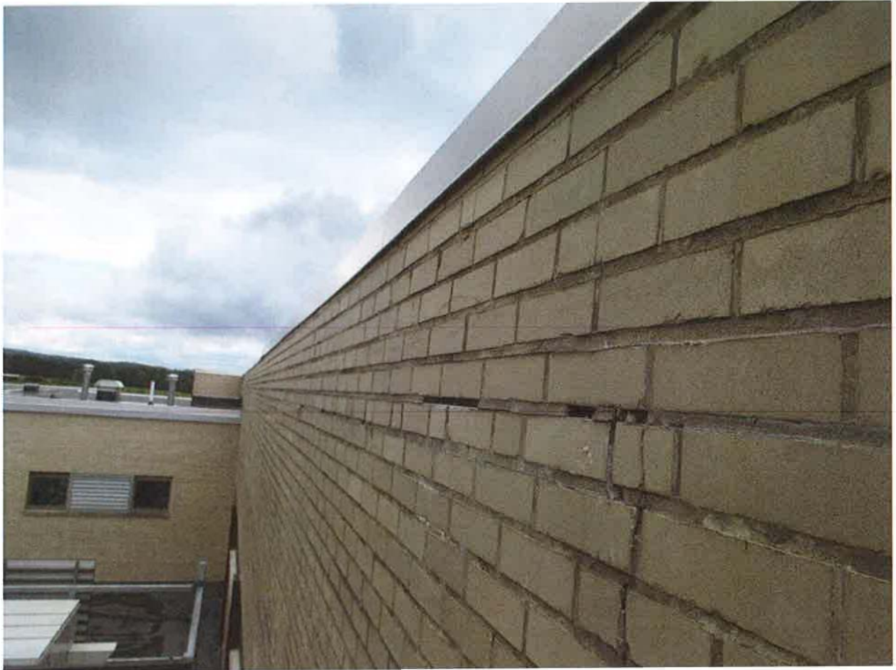
1 – Failed mortar at top of South Gym wall.