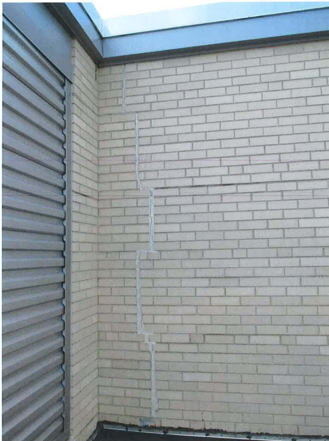
33 - Crack in brick veneer that has been repaired but evidences continued movement.