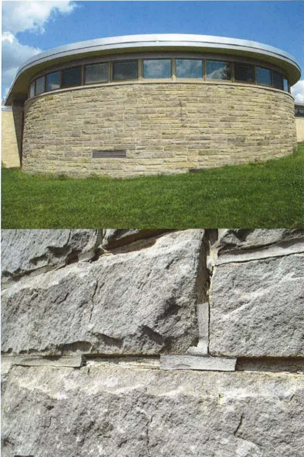
132 & 136 – Failed mortar joints at stone veneer of Band Practice Room.