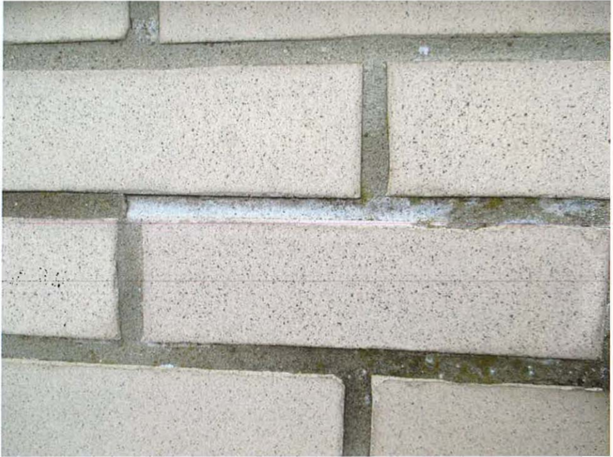
53 – Example of very shallow repointing. Some large areas were repaired with this method.