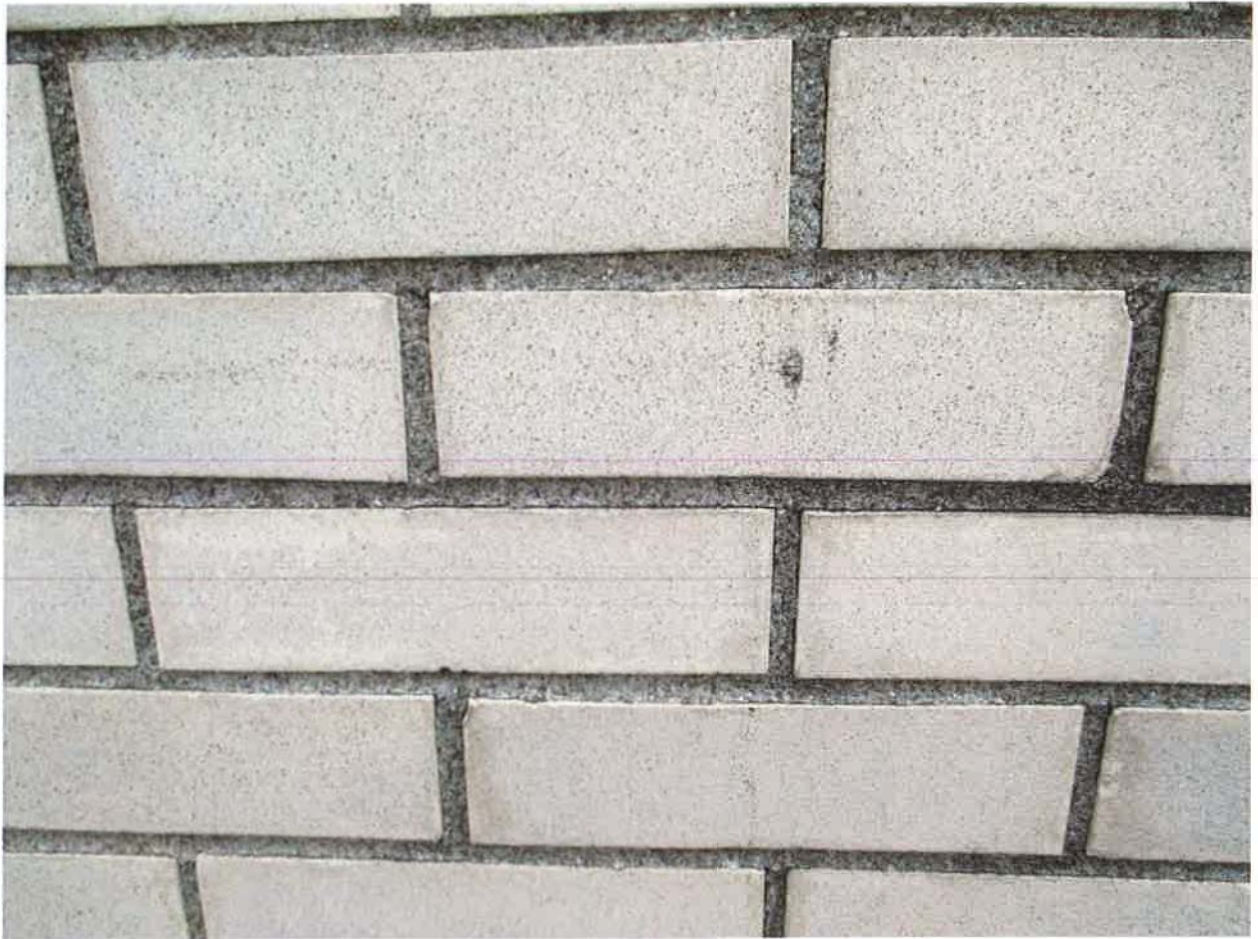
7- Typical brick veneer with noticeable dirt and mildew.