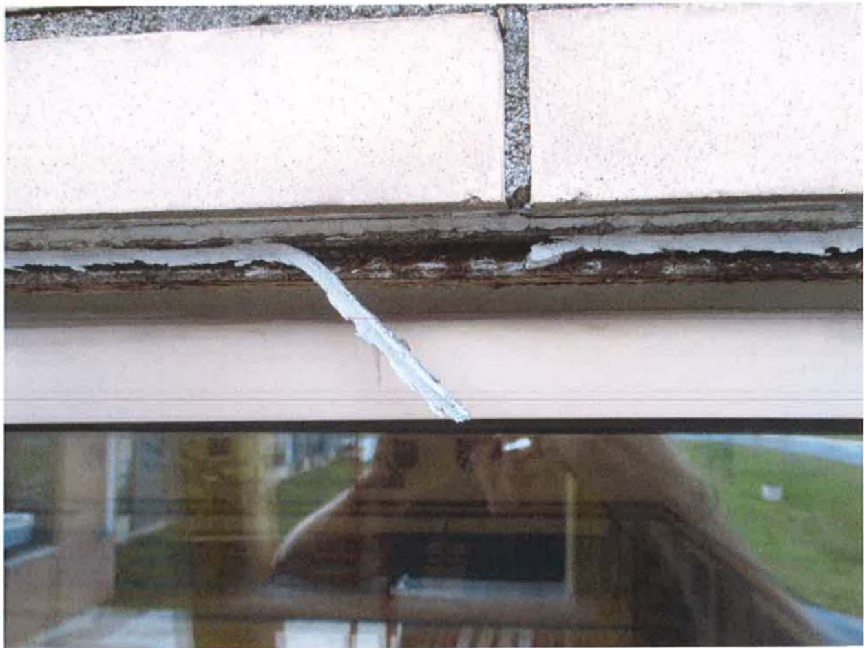
29 – Rusted steel lintel at south wall of Gym. Rust jacking has caused significant movement of the lower leg of the lintel.