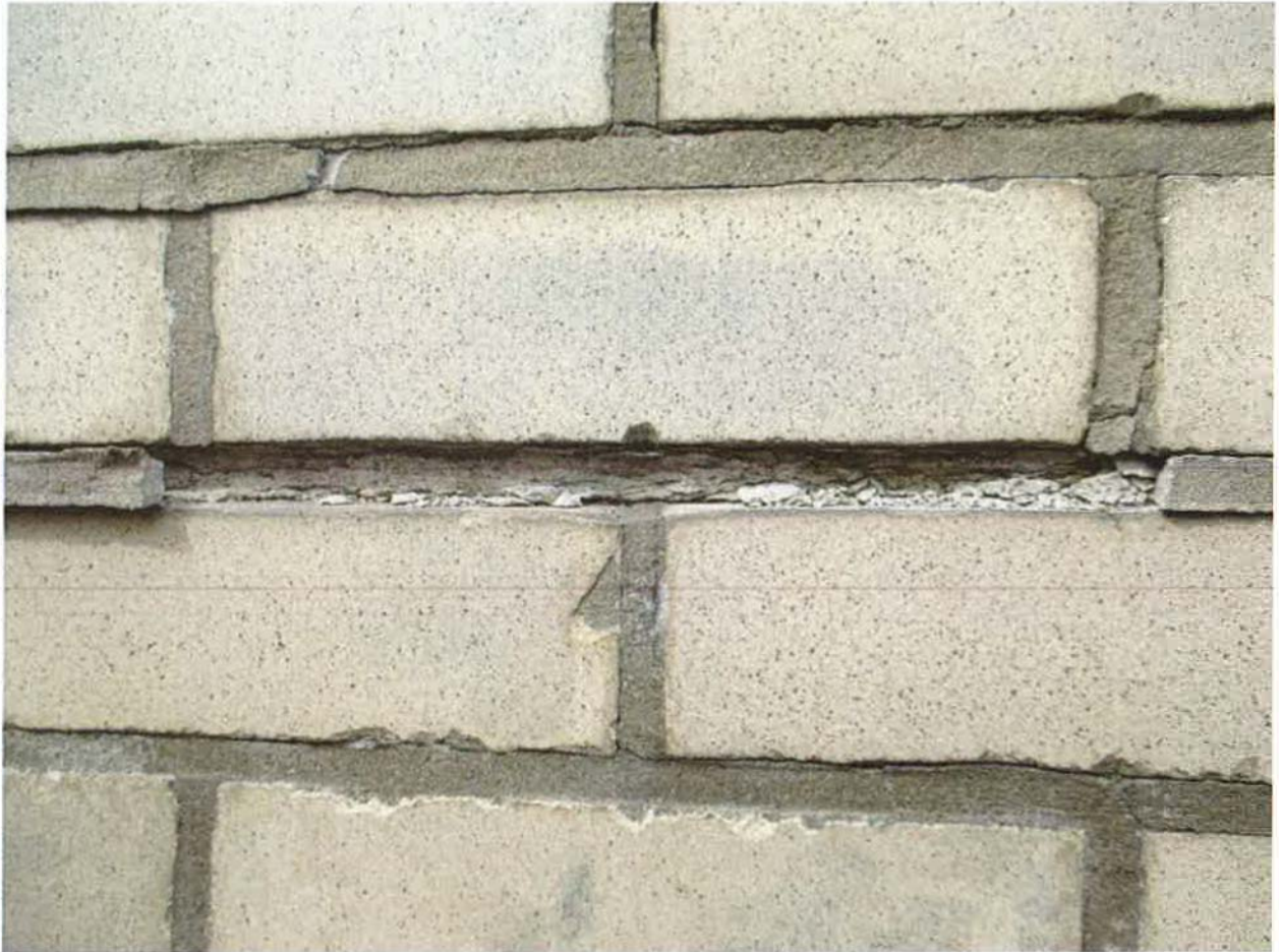
50 – Example of improper repointing. The shallow depth of the repair has led to failure, moisture intrusion and and deterioration of the remaining backup mortar.